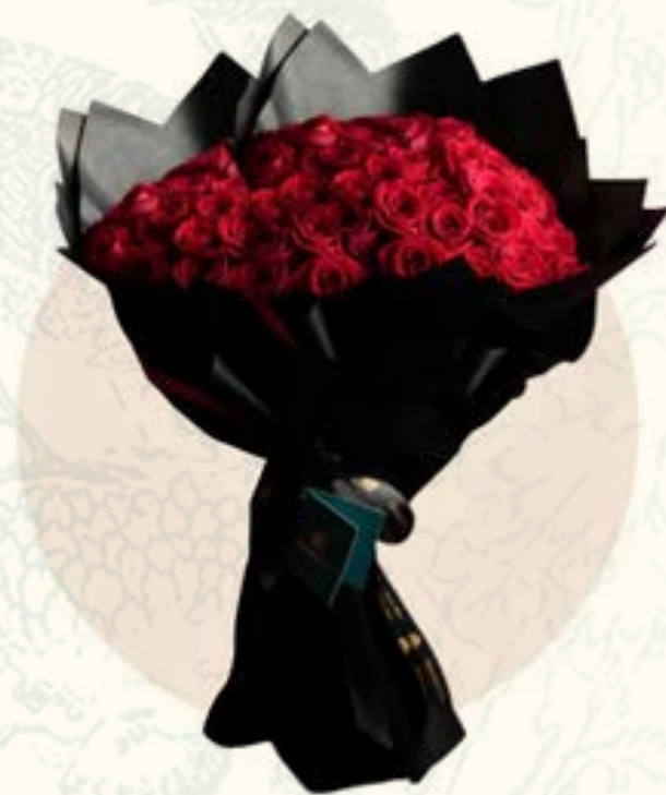
The 100 | 950 100 Red Roses