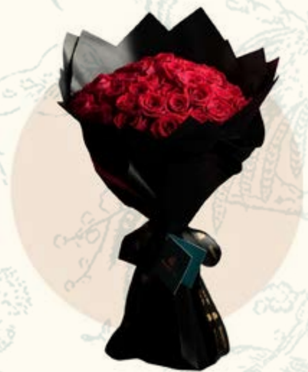
Forever Love | 450 40 Red Roses