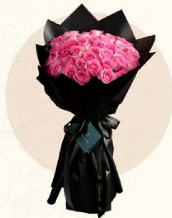
Blush Blooms | 450 30 Pink Roses