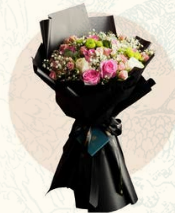
Graceful Blossoms | 400 Roses, Eustoma, Spray Roses, Limonium