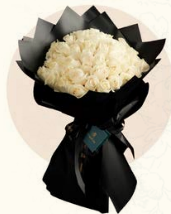
Cloud of Roses | 950 100 White Roses