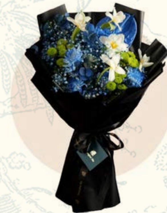
Pure Elegance | 450 Gypsophilla, Chrysanthemu, Tulip, Anthurium, Eucalyptus